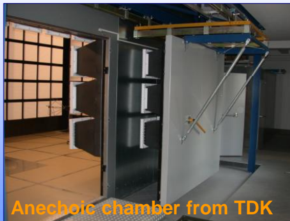
Anechoic chamber from TDK