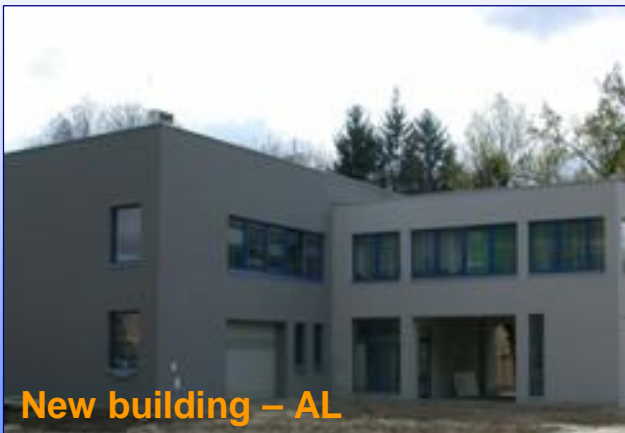
New building – AL

⇒ Semi-anechoic chamber from TDK (range 20MHz÷18GHz)